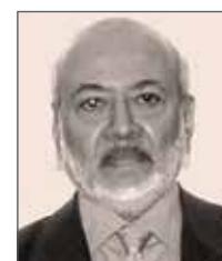
Dr. Habil Khorakiwala